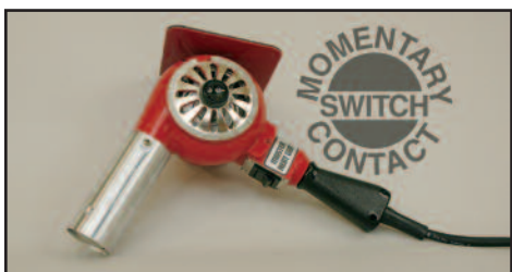
Master Heat Guns are available with optional "Momentary Contact Safety Switch" for instant-off when the trigger is released.