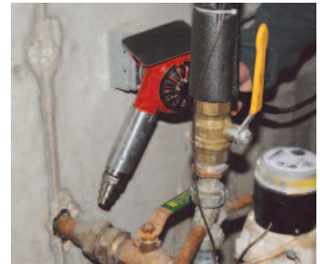
Heat pipes and more