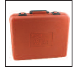
51013 Molded storage and carrying case