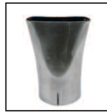
51543 2-1/4" Spreader attachment