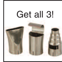
Get all 3! 35245 Three of our most popular attachments