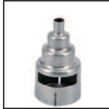
51309 3/8" Pinpoint attachment