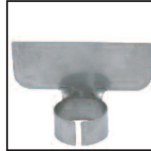
51542 Glass protector attachment