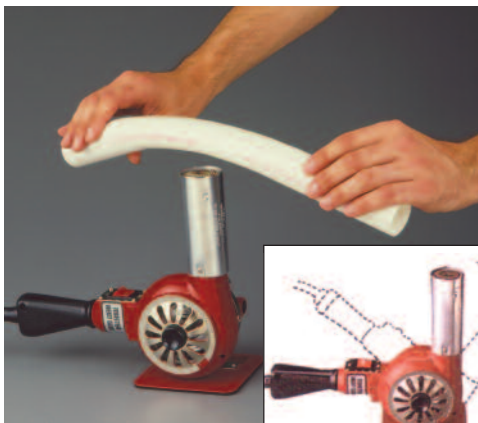
Swivel base for hands free use.

Available in four temperature ranges see back page for details