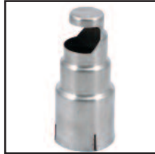
30202 Solder preform attachment