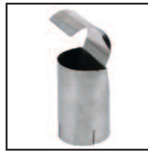
A-160-HG Shrink attachment for tubing up to 3/4"

Professional quality attachments & accessories provide the versatility to do more with your heat tool.