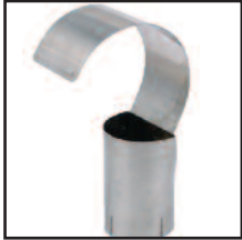
A-170-HG Shrink attachment for tubing 3/4" to 2" O.D.