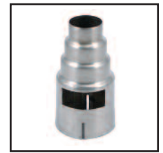
51544 7/8" Reducer attachment